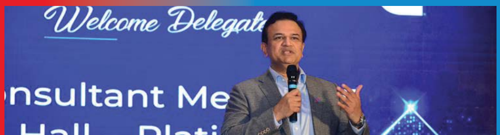
A Gathering of Visionaries