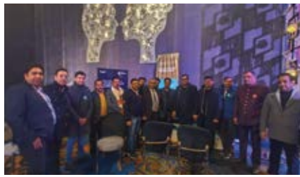
Indian Industrial Association Shamli, UP