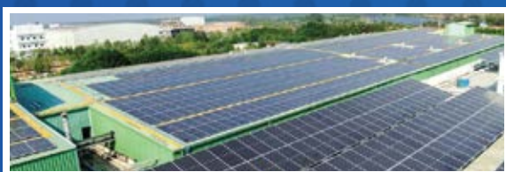
6 MWp supplied to Nalwa Steel and Power Limited Installation type - Rooftop