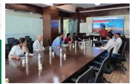
L&T Customer Training