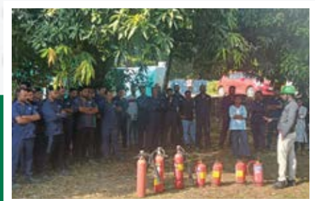
Fire Fighting Awareness Session