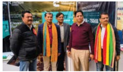
Cold Storage Association Meet, Budaun, UP