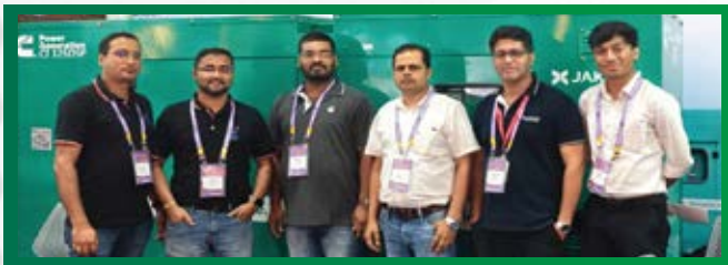
North-East Build Expo- Guwahati, Assam