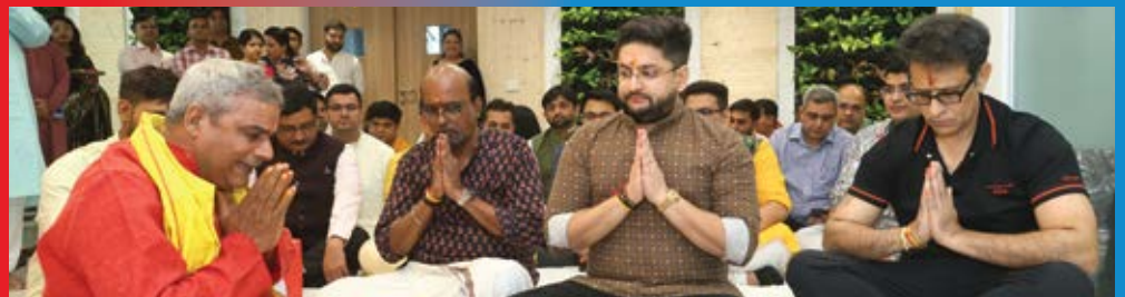
New Office Inauguration