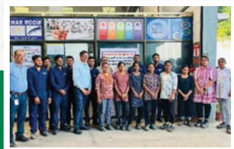
Voter List Correction Awareness Session