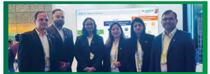
Cloud & Datacenter Convention South Asia, 2025, Mumbai