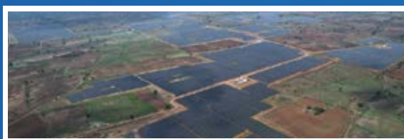
750 kWp supplied to ITC, Anarpathi, AP Installation type - Rooftop