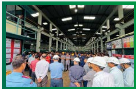
Cyber Crime Training