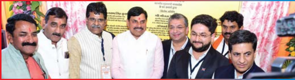
A Solar Landmark