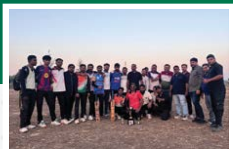
Cricket Tournament at Site