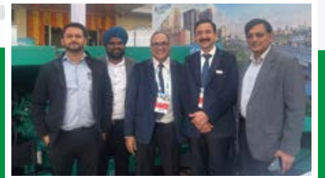
IMA UPCON Bareilly 2025