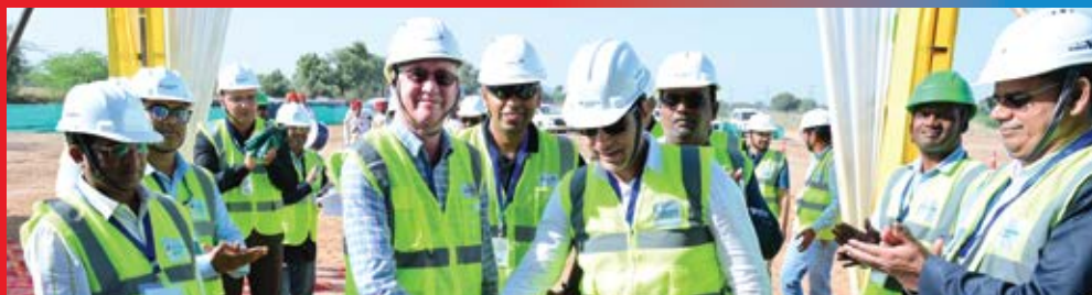
Kick-off of JGL's First Renewable IPP project 142 MWp RUVNL