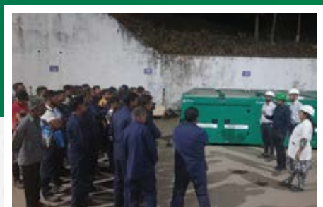
Mock Drill Training at Plant