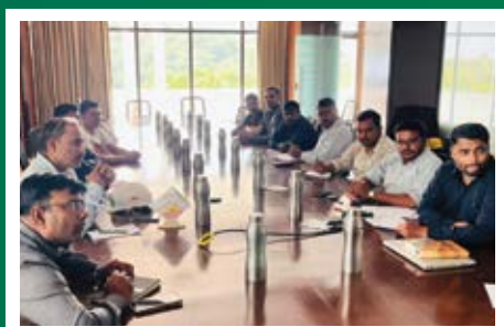
Safety Committee Meeting