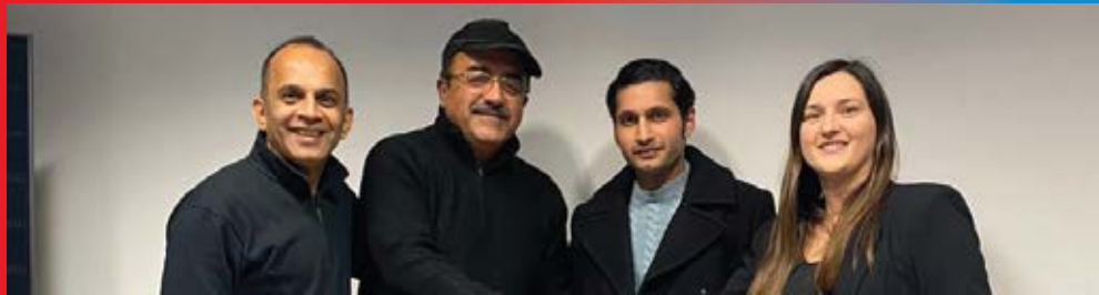
First Hi-Tech PV Recycling Plant