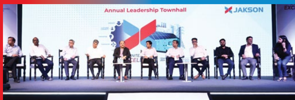
Annual Leadership Townhall