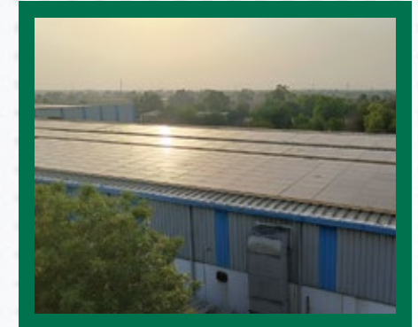
Neemrana - Pee Aar Automotive Technologies Pvt Ltd – 500 kWp.