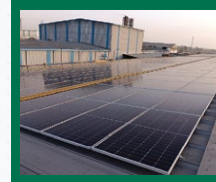
Mathura- Vacmet India- 4 MWp Plant.