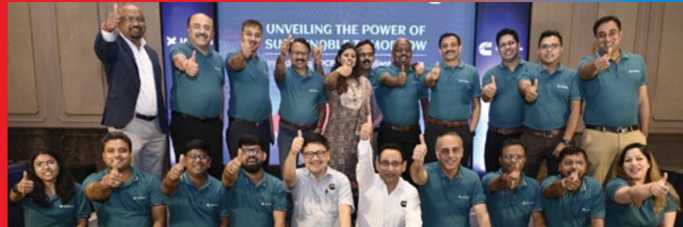
CPCB IV+ Genset Launch