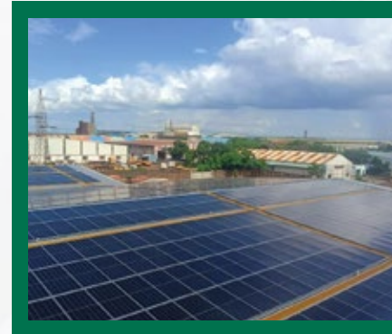
Pune- HIRSCHVOGEL- 385 kWp.