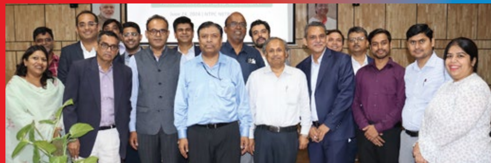
CO 2 to 4G Ethanol Project