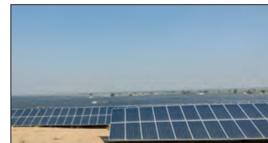
150 MWp at Bhadla HFE, Rajasthan