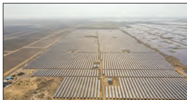
260 MWp at NTPC, Rajasthan