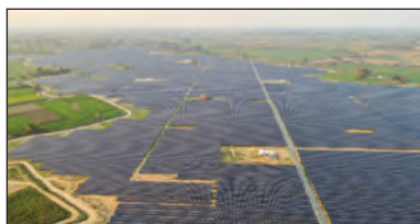
75 MWp Solar Arise at Budaun Uttar Pradesh