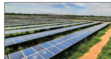
65 MWp at NLC Tamil Nadu