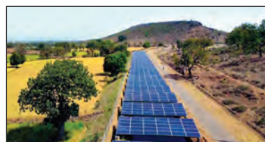
6 MWp Canal-top in Lalitpur, Uttar Pradesh