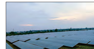
27 MWp Solar Arise at Koppal, Karnataka