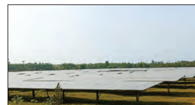
5.5 MWp at Midnapore - Dalmia, West Bengal