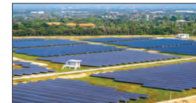
100 MWp at NLC Tamil Nadu