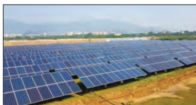
10 MWp at Visakhapatnam Port Trust, Andhra Pradesh