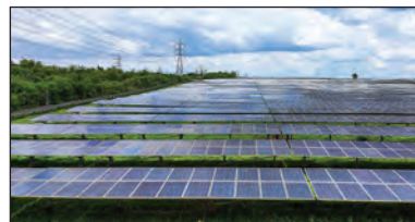
250 MWp at Anantapuram, Andhra Pradesh