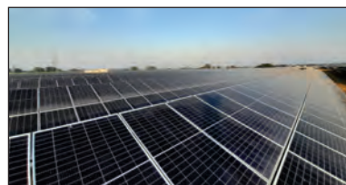
67 MWp JPPL at Agra, Uttar Pradesh