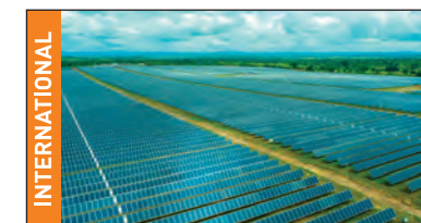
50 MWp at Republic of Togo, West Africa

A-43, Phase-II Extn., Hosiery Complex, Noida-201305, U.P., India