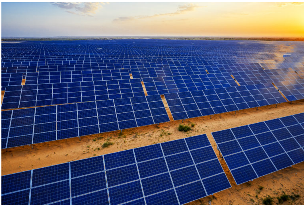
Jakson's 70 MW solar park in Assam