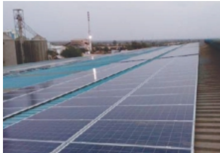
540 KW at Adani Group, Rajasthan