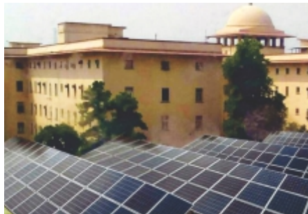
250 KW at Shastri Bhawan, Delhi