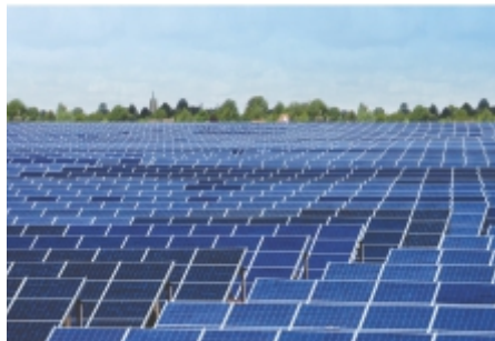
21x2 MW Punj Lloyd Limited, Mansa, Punjab