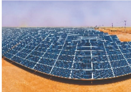
65 MW at NLC, Tamil Nadu