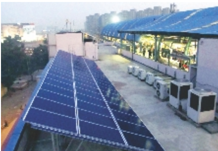
250 KW at DMRC, Delhi