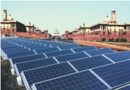
508 KW at President's Estate, Delhi