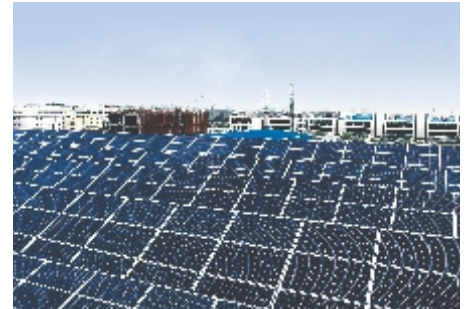
600 KW at Varanasi Airport, UP