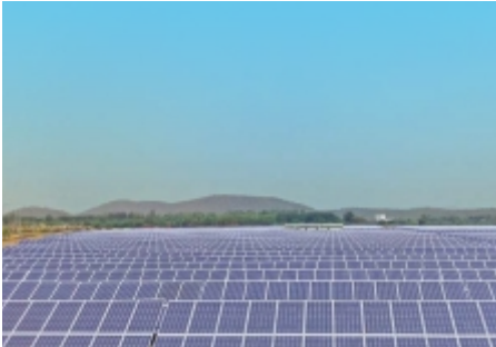
10 MW at NTPC Talchar, Odisha