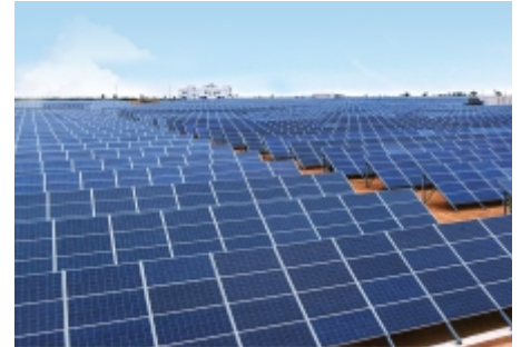
10 MW at Lalitpur, UP