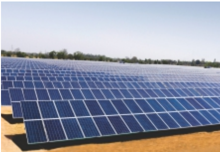
30 MW at Green Urja (P) Limited, Mahoba, UP