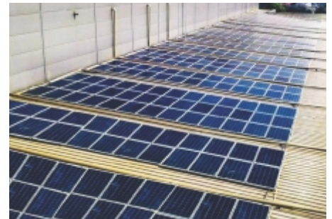
400 KW at Yamuna Sports Complex, Delhi