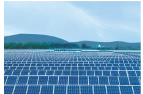
65 MW NTPC Limited, Rajasthan